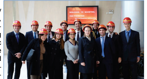
The LASP delegation at the Baosteel Plant in Shanghai