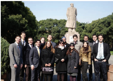
The LASP group at Fudan University