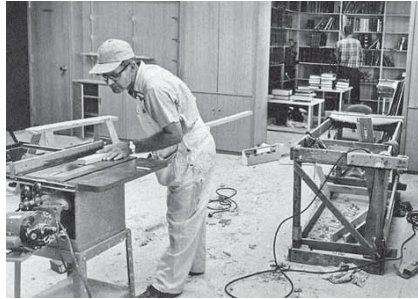
A construction worker putting the finishing touches on the Nitze Building in time for the October 1963 convocation