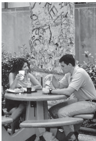
A section of the Berlin Wall stands in the Nitze Building Courtyard.