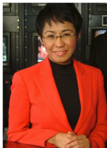
Maria A. Ressa

The Philippines Roundtable , the principal forum in Washington, D.C. for the discussion of Philippines issues and U.S.-Philippines relations, is made possible by the steadfast support of individuals. The Roundtable resumed this spring with Maria A. Ressa , author-in-residence, International Centre for Political Violence and Terrorism Research, S. Rajaratnam School of International Studies, Singapore, on “Media for Social Change.”