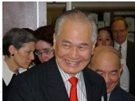
Former Prime Minister of Thailand Anand Panyarachun, arriving at the conference.